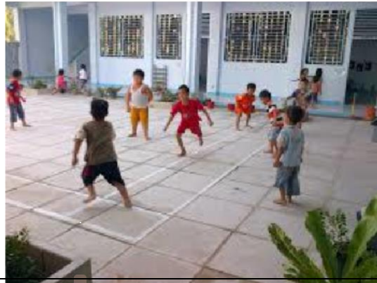
Figure 1. Slodoran – A Local Game

The composition of the local wisdom-based parenting model comprises: a description; an explanation; cultural values; an evaluation, and feedback. The descriptions contain brief explanations from the model's theme, with characteristics of philosophical values or games. Based on Figure 1, for example, Slodoran traditional game is a game comprising two groups of three – to play or guard the fort against the enemy seeking to enter. The explanation contains detailed information on the theme. The cultural values explain the intrinsic aspects of the games' themes.