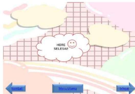
Figure 7. End game Display

The third , based on the results of the analysis, the score f_{\text{count}} = 0.39367 > f_{\text{table}} = 0.416 at a significance level of 0.05, so the null hypothesis ( H_0 ) is rejected. Thus it can be concluded that, "there is an influence of ECG on early childhood language skills". While the R square table obtained 0.559, which means that the influence of ECG on language skills is 56%, while the remaining 44% is influenced by other factors not discussed in this study. This is proven at the last analysis stage through the t_{\text{-test}} , the result is t_{\text{count}} = 11,179 > 2,039 = t_{\text{table}} , then ( H_0 ) is rejected and ( H_a ) is accepted. Thus it can be concluded that, "ECG has a significant effect on early childhood language skills".