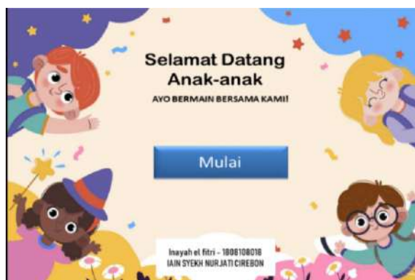
Figure 2. Start Screen Display

The second , based on the expert's assessment of the application, it is concluded that ECG is suitable for use in learning to improve early childhood language skills. The application of ECG in improving children language skills by operating computers: (1) On the first screen there are words "Welcome" and "Come play with us", then the child clicks the "Start" button to start the game (figure 2).