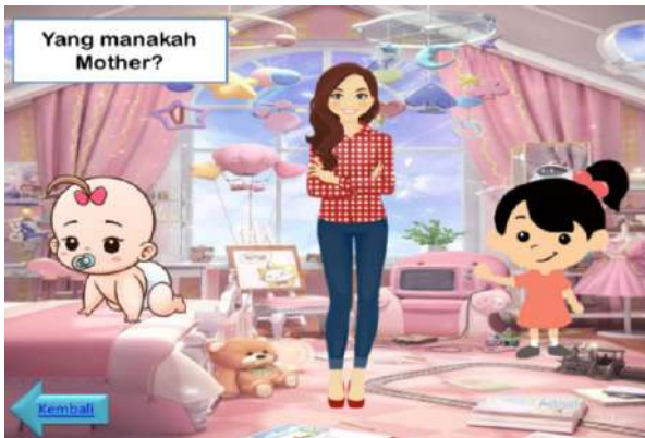
Figure 4. Educational games Screen Display

the child clicks on the Baby or Sister image, then on the screen there is a sad emoticon and a bomb sound which means the answer is wrong (figure 5).