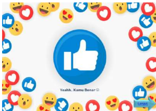
Figure 6. emoticon response display for correct answer

(5) If the child clicks on the picture of Mother, the screen will have a thumbs-up emoticon and the sound of applause, which means the answer is correct (figure 6). (6) If the game is finished there is a screen at the end that says "hurray finished" (figure 6).