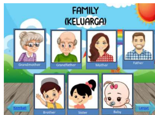
Figure 3. Family number Screen Display

(2) The screen contains pictures for examples of family members, where before playing the teacher explains the pictures of the members. After the child understands, the child clicks the next symbol/button (figure 2). (3) The screen there are 3 pictures or 2 pictures where one of them has the correct picture. The way the child clicks on the image is according to the questions on the screen such as "Which one is Mother?" then on the screen there are 3 pictures, namely Baby, Mother and Sister. Then the child clicks on the correct answer (figure 4). (4) If