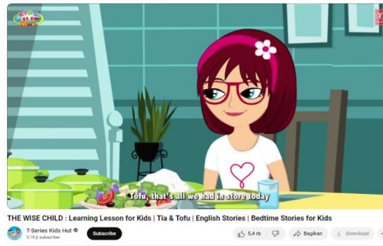
Figure 3 The Wise Child English Story

In this study, researcher focus on YouTube English Movie entitled "The Wise Child" (Fig.3). English Movie can also be referred to as motion picture or more commonly called as film (Halawa et al. , 2022)