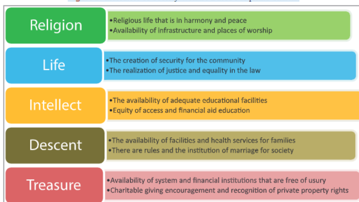
Figure 2: Indicators of Society Welfare Based Maqashid Shariah