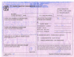
Proof of Payment.jpg 1733K

Best Regards, Aan Jaelani State Islamic Institute Syekh Nurjati Cirebon/ IAIN Syekh Nurjati Cirebon Indonesia