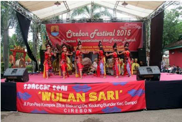
Figure 5 – Cirebon Festival