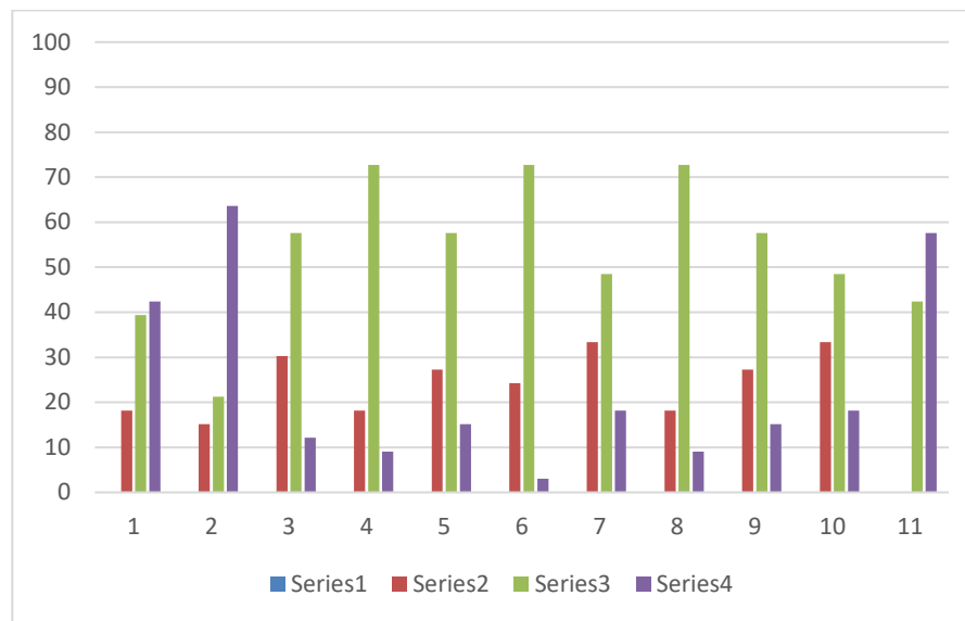
Figure 2. Graph of ICT skills percentage through self-assessment on prospective teachers [Description: series (1) requires intensive guidance, (2) mastering with learning in others, (3) mastering independently and (4) proficient with development

Figures 1 and 2, illustrate the percentage of ICT skills of prospective teachers both through observation and self-assessment for all aspects of the indicator, on average prospective teachers are at level three by independently mastering. This proves that the prospective teacher has mastered ICT independently and uses technology as a tool and source of learning. Measurement of ICT skills is done through observation and self-assessment carried out to test the equality of differences between observation and self-assessment. The variance test between ICT skills on prospective teachers through self-observation and assessment is explained in Table 2 below.