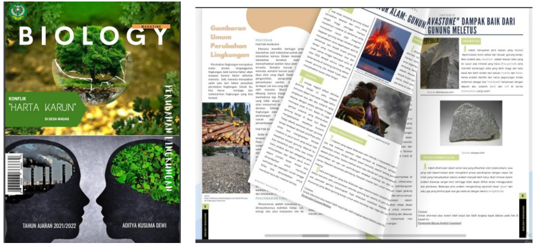
Figure 3. Displays of BioMagz in printed and electronic versions

BioMagz contains material on environmental changes with an approach to socio-scientific issues. This BioMagz has a visual representation of adhesive rocks in Wadas Village and contains discourses of social conflicts in the community. The display of adhesive rock features and the discourse of social conflicts in Wadas village are presented in Figure 4.