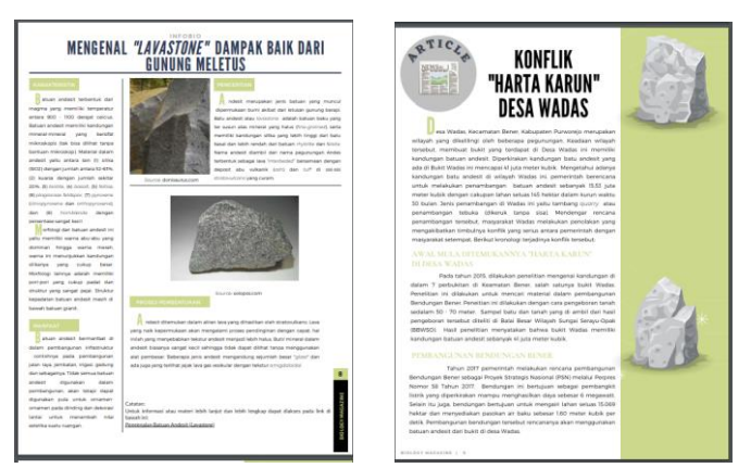
Figure 4. Displays and discourses in BioMagz representing adhesive rocks and social conflicts

BioMagz contains material on environmental changes with an approach to socio-scientific issues. This BioMagz has a visual representation of adhesive rocks in Wadas Village and contains discourses of social conflicts in the community. The display of adhesive rock features and the discourse of social conflicts in Wadas village are presented in Figure 4.